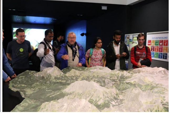
Visit to the museum ("Haus der Berge") of the National Park Bechtesgaden