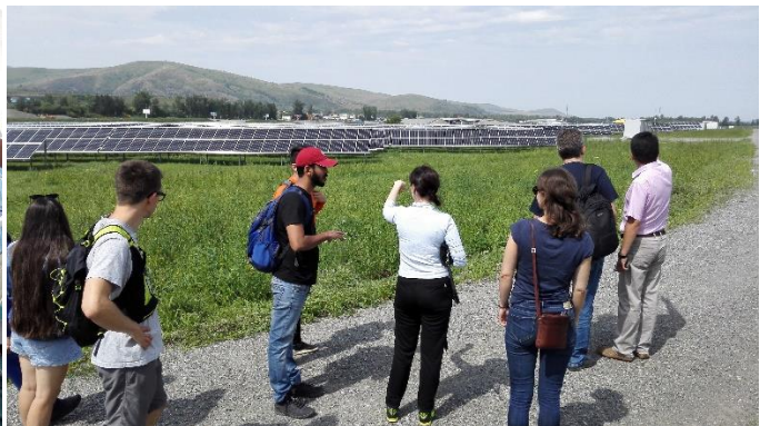
Participation of the PLUS members in the different activities organised during the Summer School